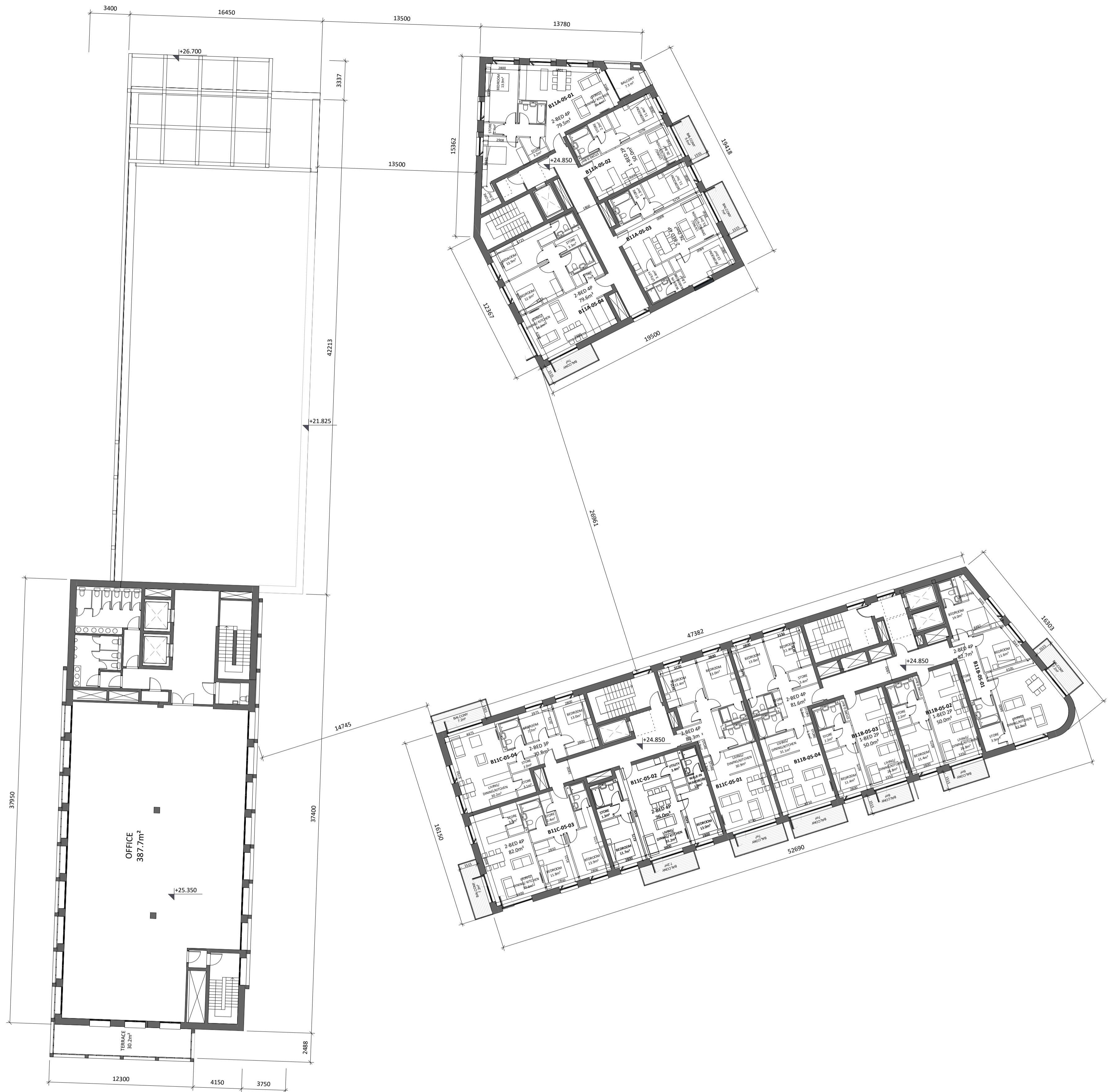
BLOCK 12 LEVEL 04